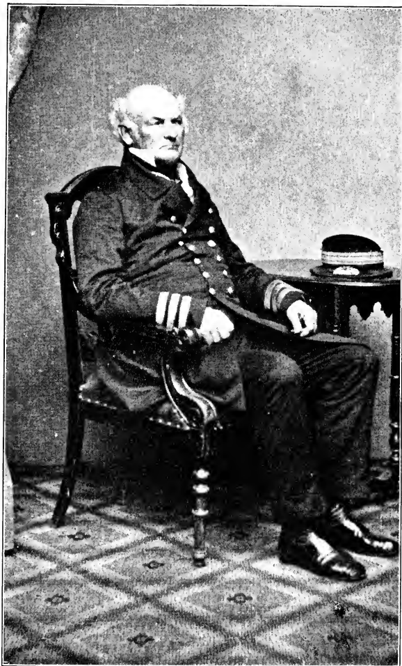
HIRAM PAULDING Commodore, U. S. N. About 1857